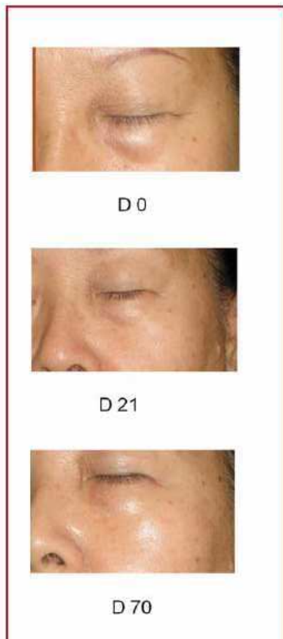
Figure 3. Effect of the test serum on pockets and rings under the eyes

tetrapeptide 7, retinol and ubiquinone, while dipalmitoyl hydroxyproline and hesperitin citrus extract display anti-elastase activities that preserve elastin fibers. GAG components of the ECM could be protected with glycyrrhizate, which has anti-hyaluronidase activity.