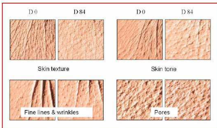
Figure 1. Effect of the test serum on skin parameters

the flattening at the dermal-epidermal junction (DEJ) and loss of dermal papillae. The latter forms villousities that facilitate nutritional exchanges and metabolic by-product evacuation between the dermis and the epidermis. Their disappearance with aging contributes to the slowing of epidermal cell turnover. The DEJ is a structure of major importance for skin cohesion since it anchors the epidermis to the underlying dermis. This zone is constituted by various types of anchoring fibrils such as fibronectin, laminin and collagen IV. Collagen IV is an exclusive member of the basement membranes, whose structure forms supramolecular networks that influence cell adhesion, migration and differentiation. 40 Collagen IV is essential for the mechanical stability of the skin. Studies have shown that collagen IV content decreases with age after 35 years, weakening the skin structure and contributing to wrinkle formation. 41